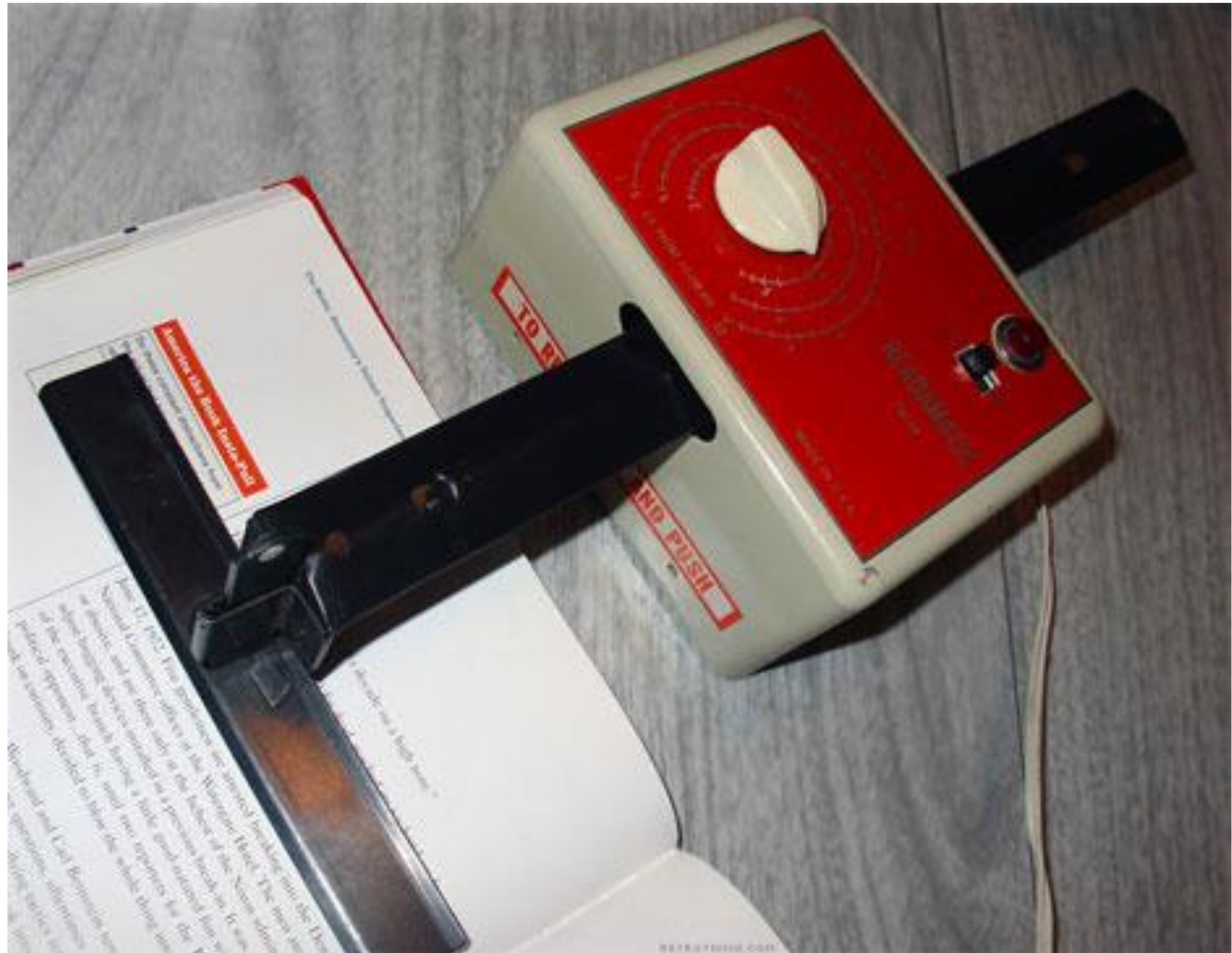
Robot Readamatic, 1963